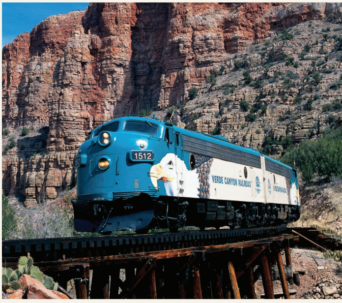
Journey aboard the Verde Canyon Railroad

This morning, stop in Jerome, an old mining town and melting pot for those who dreamed of making a quick fortune. Once virtually a ghost town, it is now restored with shops, museums and art. Later, climb aboard the Verde Canyon Railroad for a spectacular journey over old-fashioned trestles, past ancient Indian ruins and through a 700-foot tunnel. Enjoy the views from the comfort of your First Class seat or from one of the open-air viewing cars. Watch for wildflowers, blooming cacti and wildlife in their natural habitat. Tonight, chow down with a chuckwagon supper at the "Blazin' M Ranch" and Western Stage Show. Meals: B, D